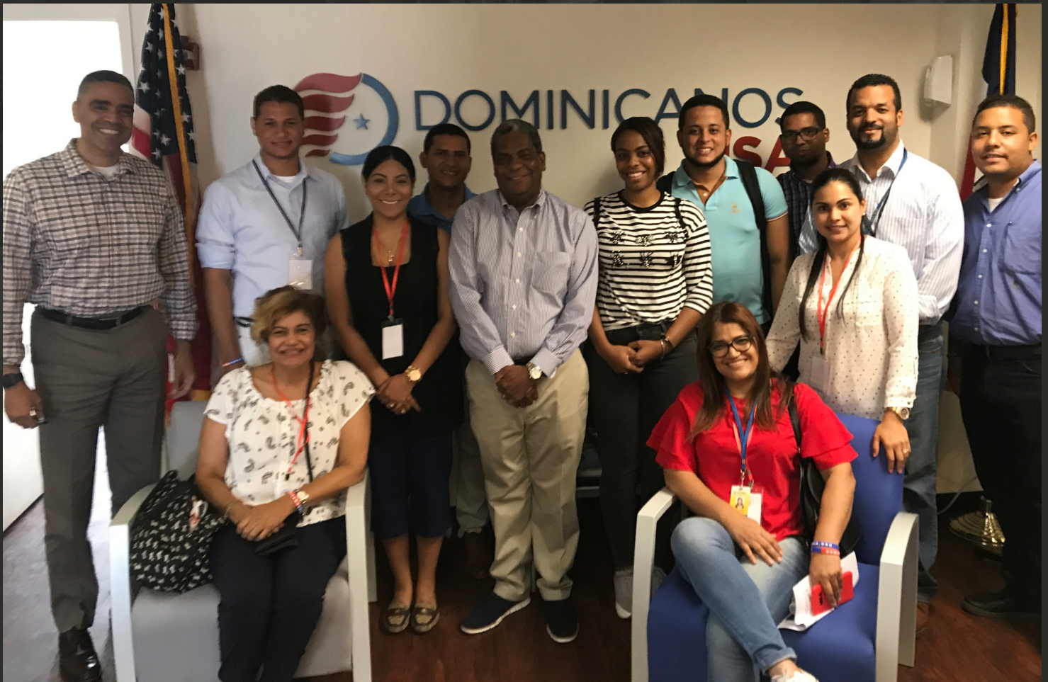
Visit from Pontificia Universidad Católica Madre y Maestra

On 06/30 DUSA staff and volunteers participated in CUNY's Citizenship Drive and Immigrant Resource Fair at John Jay College in New York City